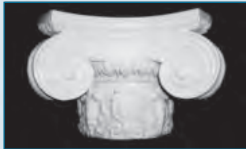
Angular Greek Ionic with Necking**