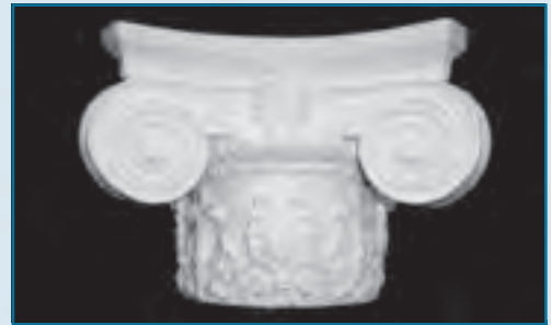
Empire with Necking**