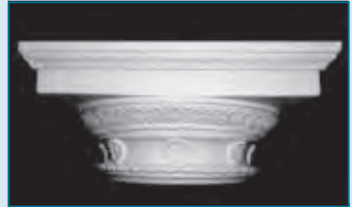
Decorative Roman Doric