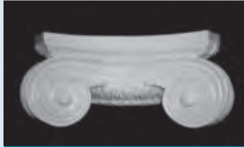
Angular Greek Ionic