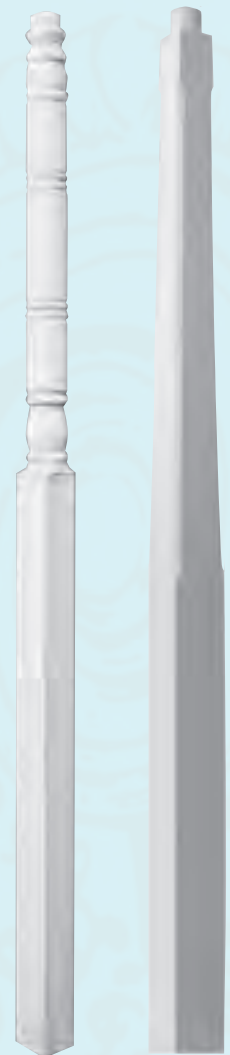
CHAMFERED LAMP POST

*Load-bearing capacity is dependent on the concentric loading of the post. NOTE: All sizes are nominal.