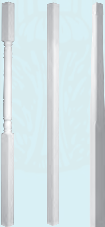
5" OR 6" COLONIAL POST 5" SQUARE POST 6" CHAMFERED POST